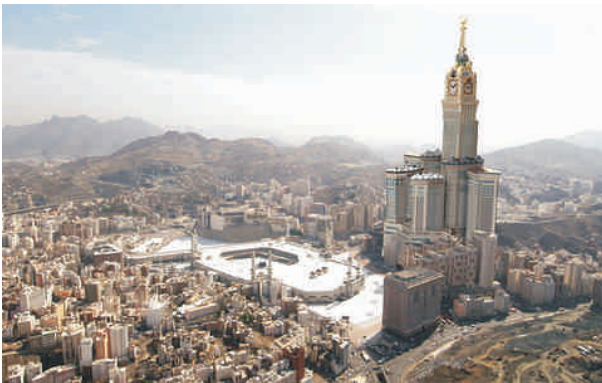
Distance 0-Meter from Masjid-Al-Haram